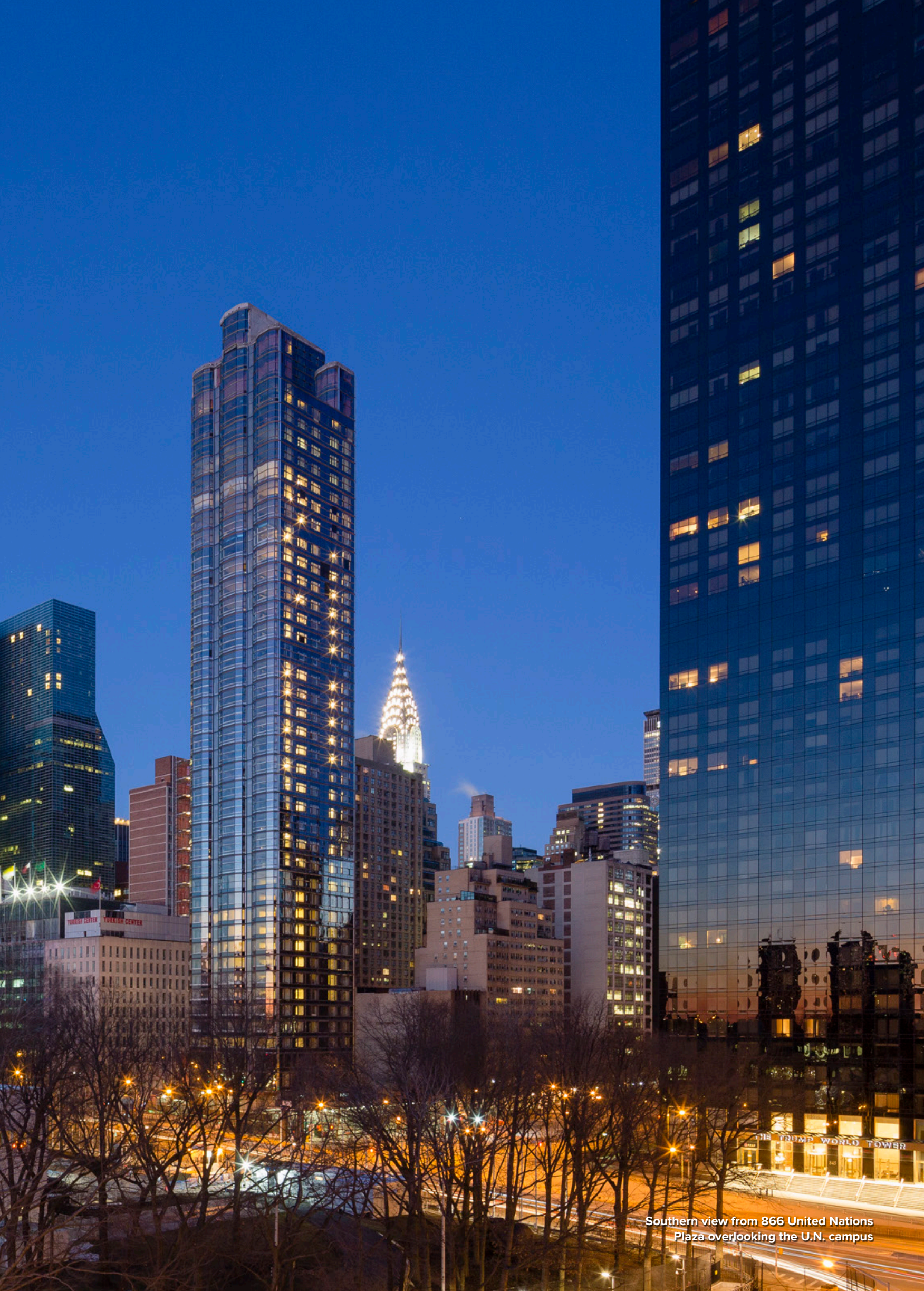
Southern view from 866 United Nations Plaza overlooking the U.N. campus