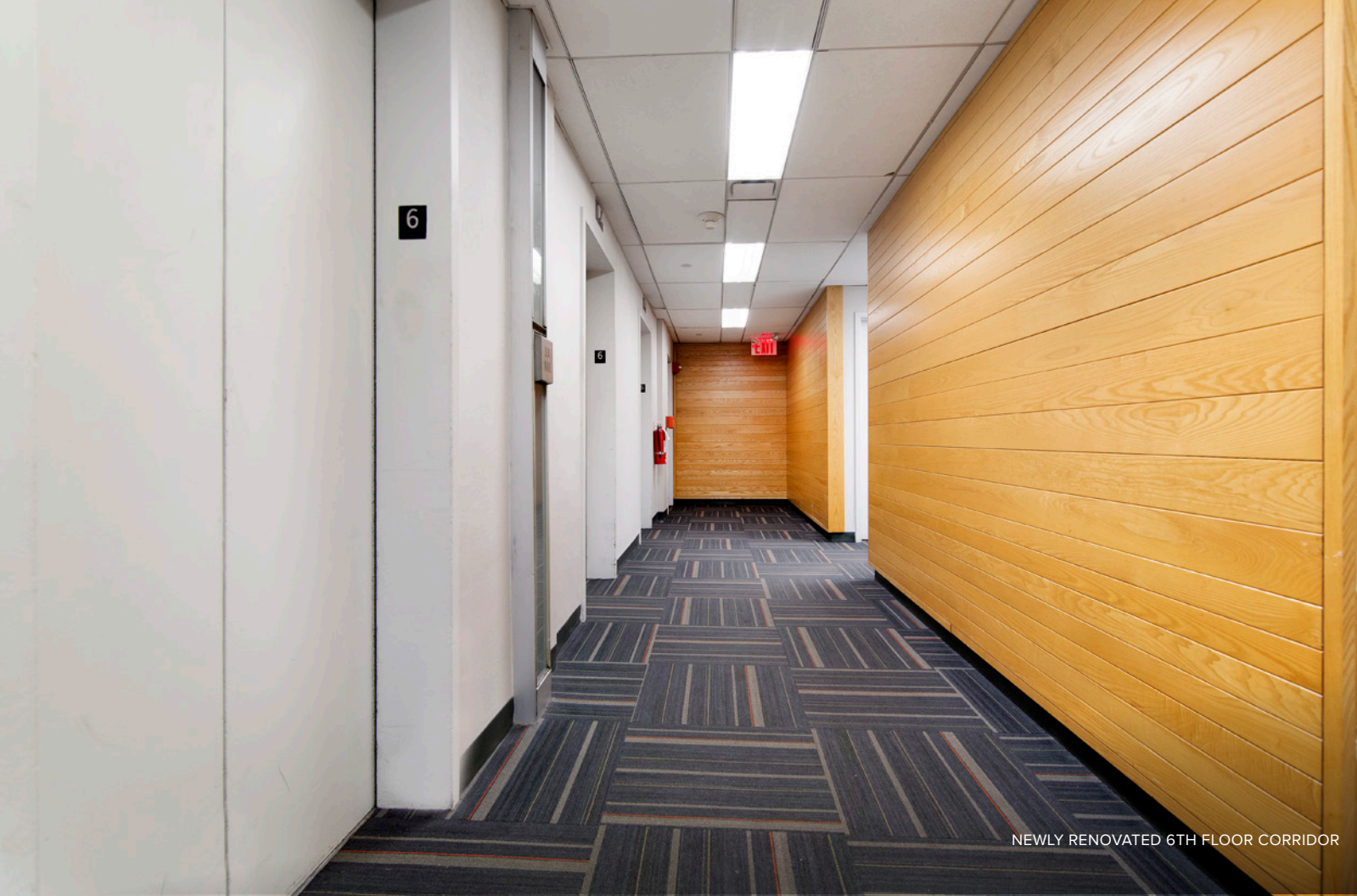
NEWLY RENOVATED 6TH FLOOR CORRIDOR