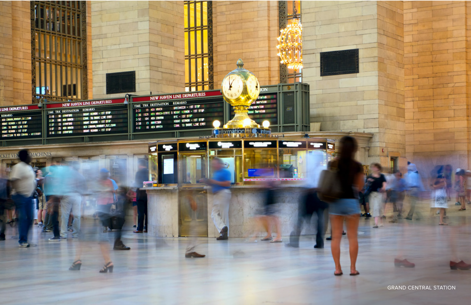
GRAND CENTRAL STATION