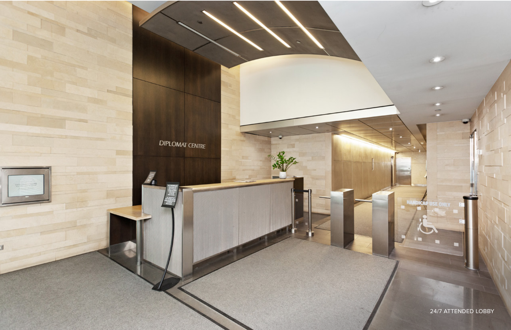
24/7 ATTENDED LOBBY