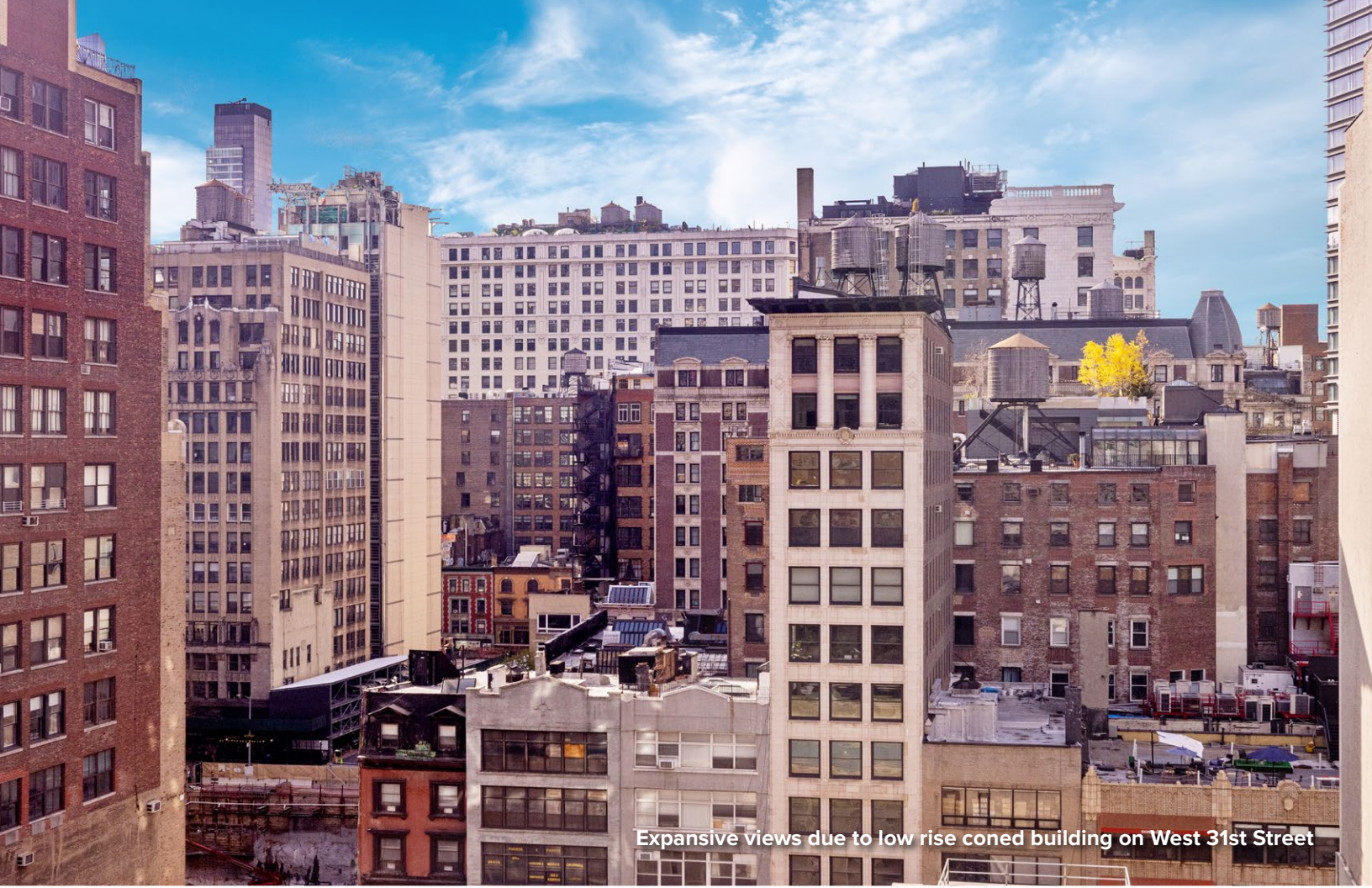
Expansive views due to low rise coned building on West 31st Street