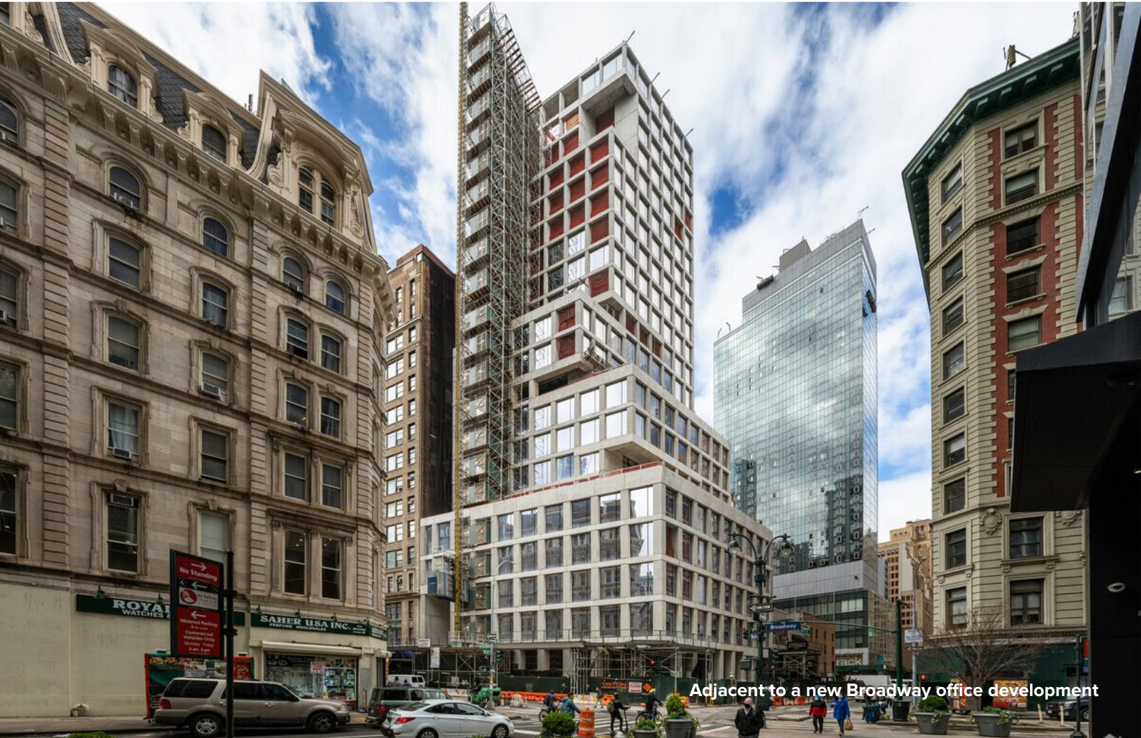
Adjacent to a new Broadway office development