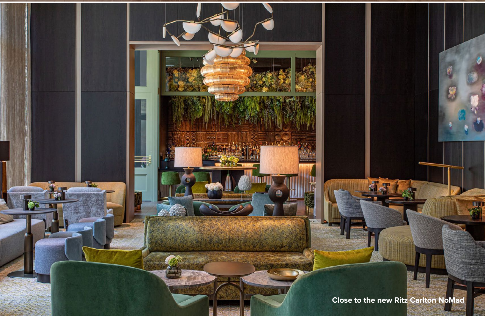
Close to the new Ritz Carlton NoMad