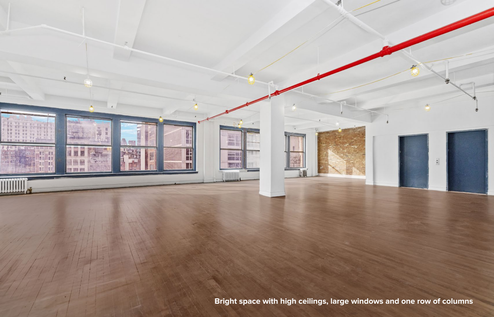
Bright space with high ceilings, large windows and one row of columns