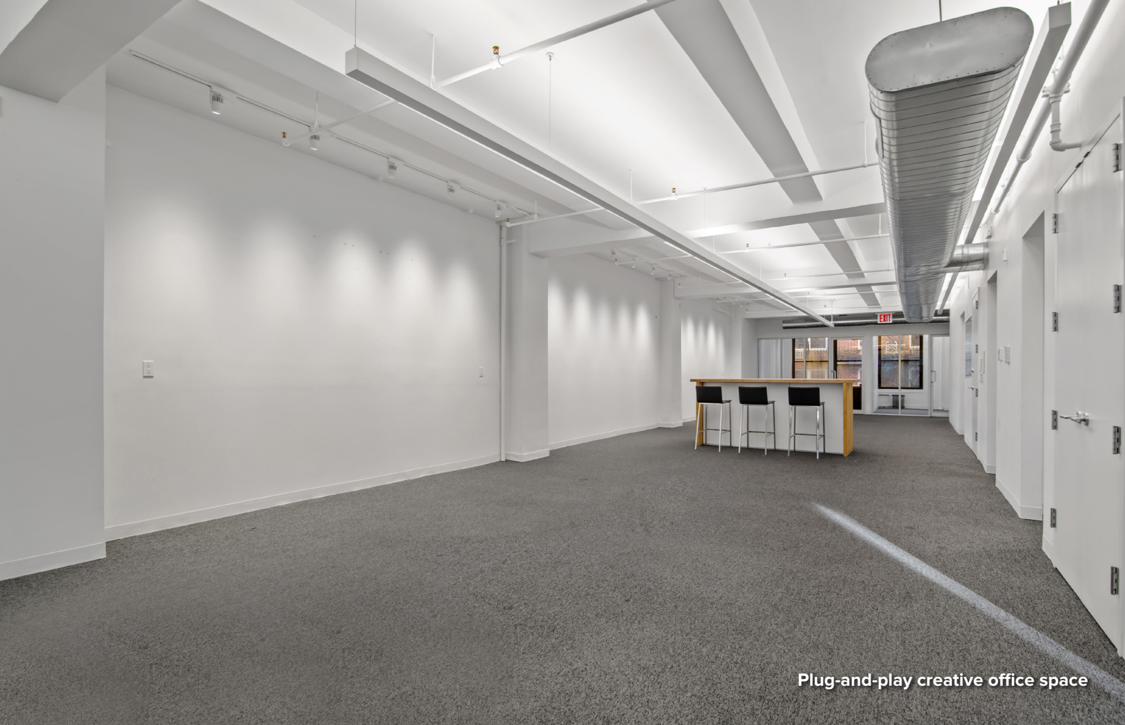
Plug-and-play creative office space