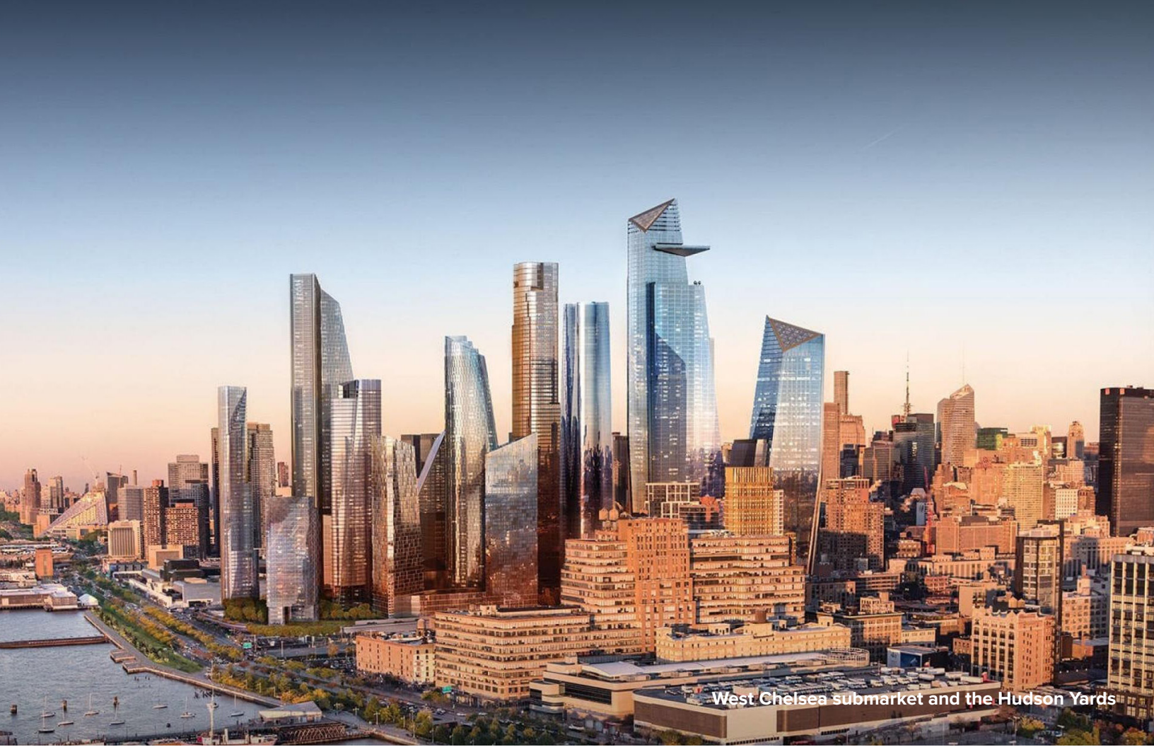
West Chelsea submarket and the Hudson Yards