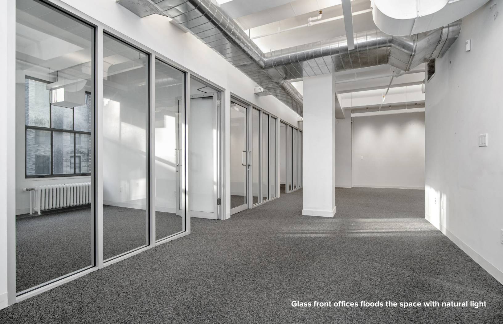
Glass front offices floods the space with natural light