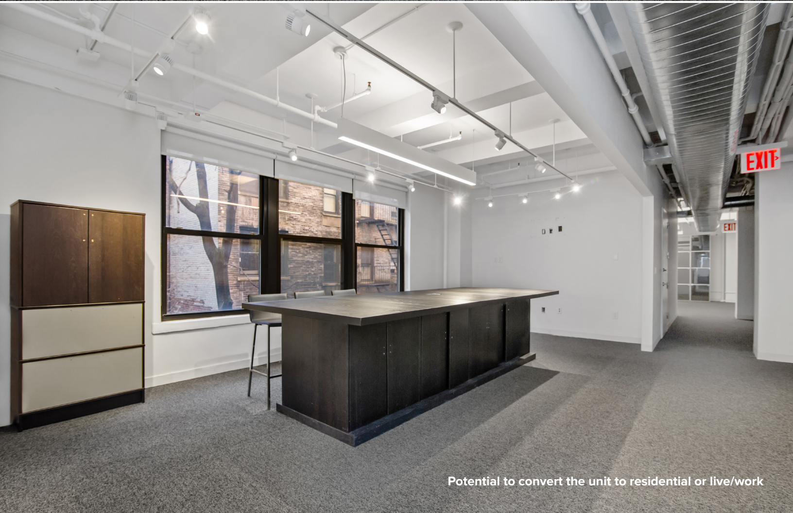
Potential to convert the unit to residential or live/work