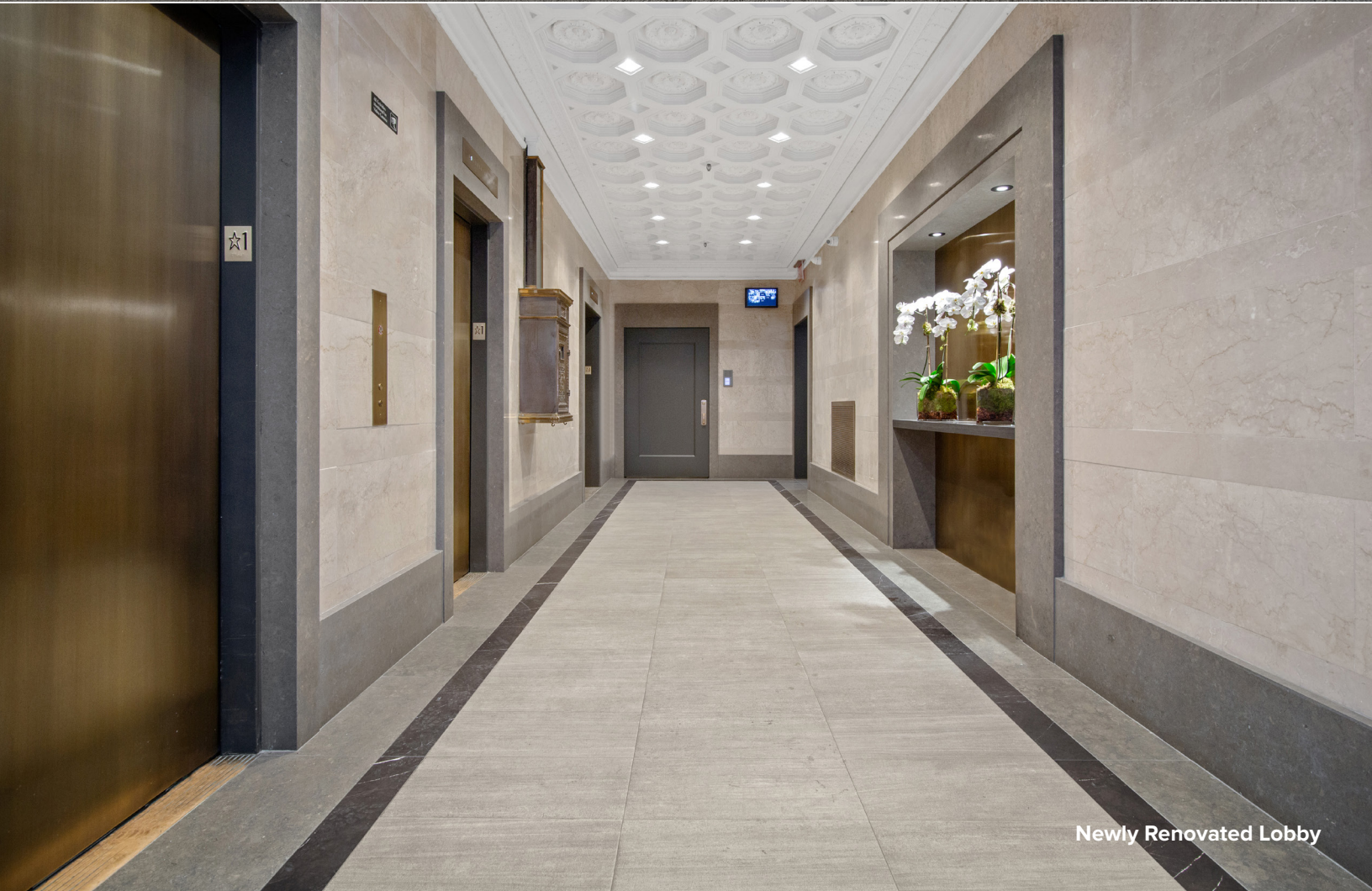
Newly Renovated Lobby