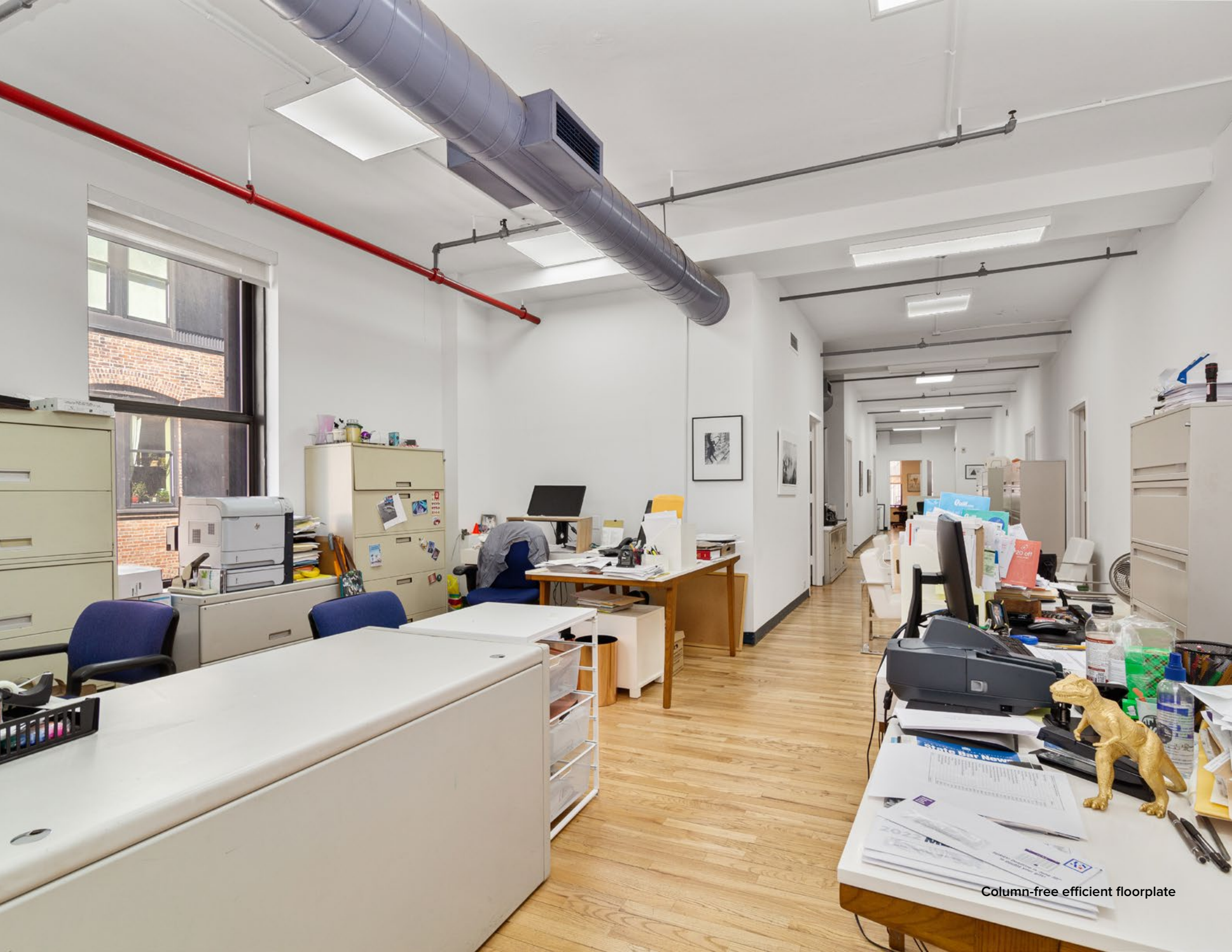
Column-free efficient floorplate