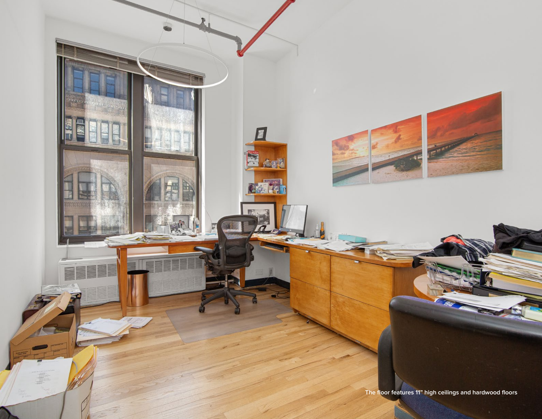
The floor features 11" high ceilings and hardwood floors