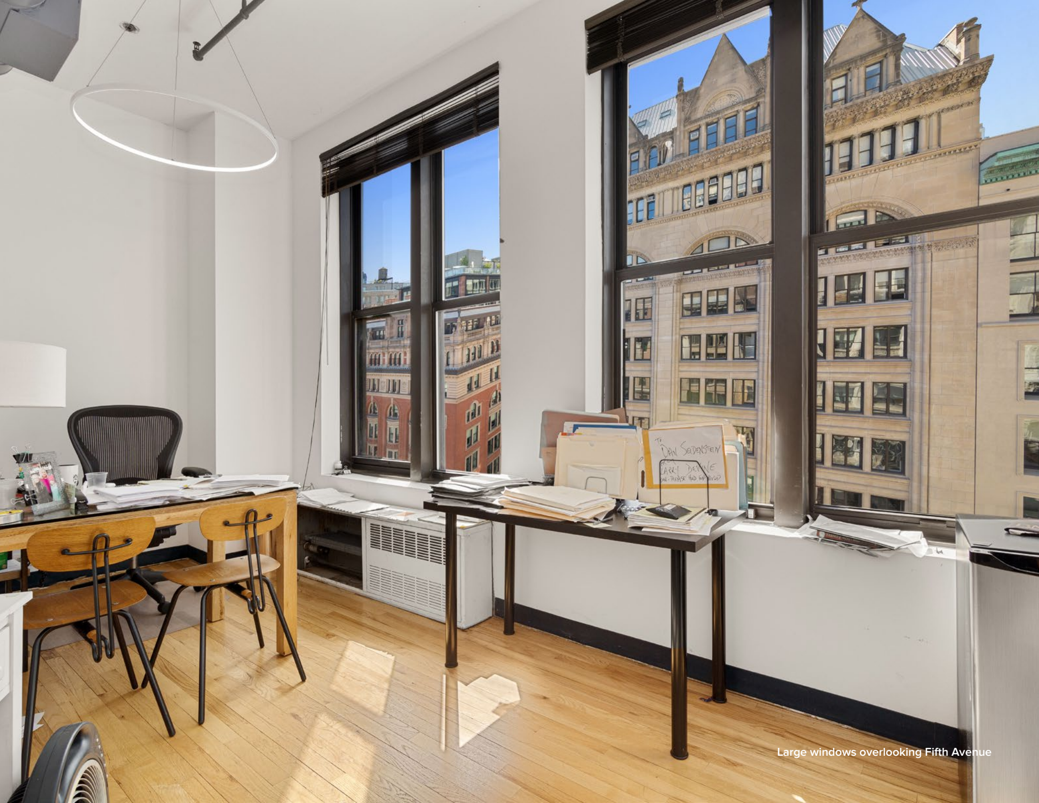
Large windows overlooking Fifth Avenue