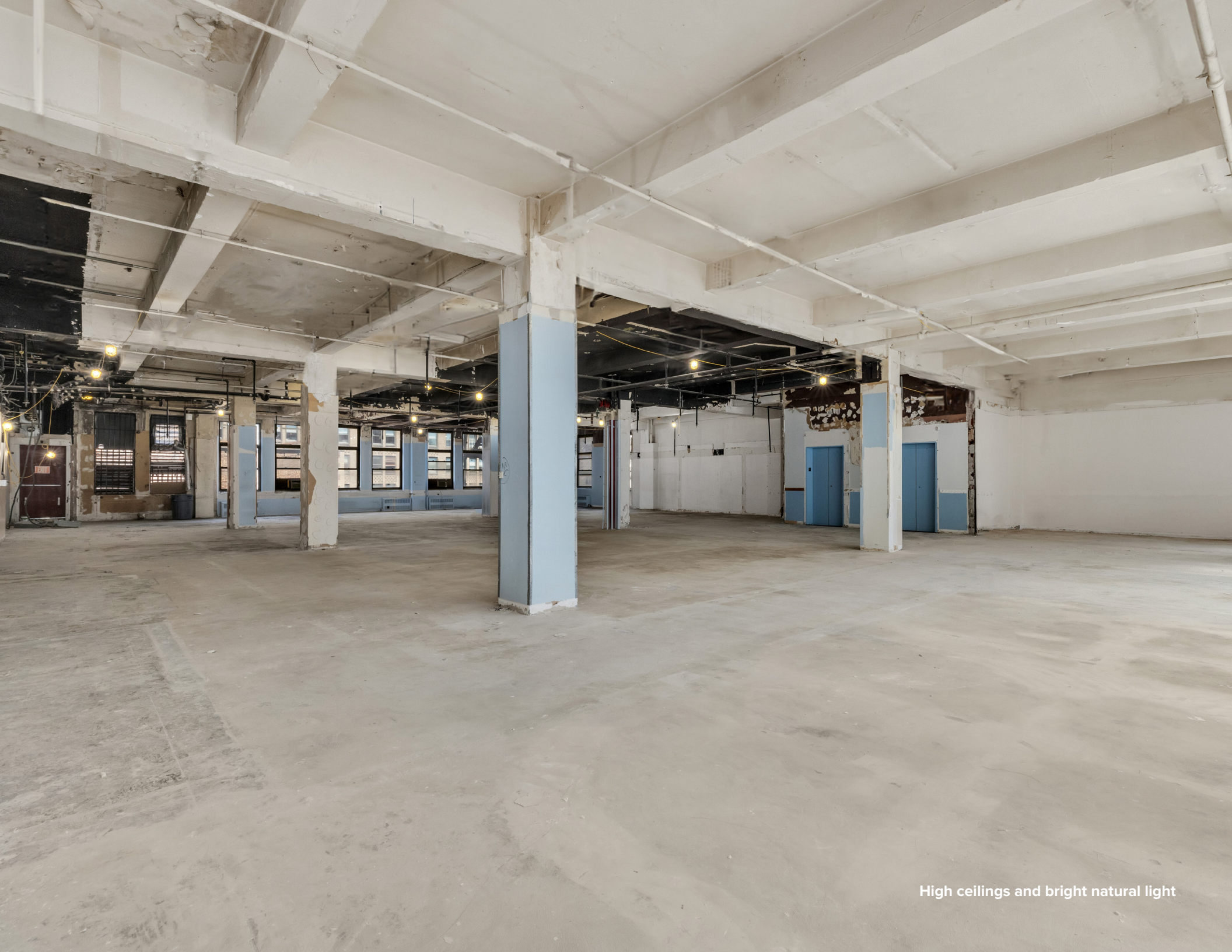
High ceilings and bright natural light