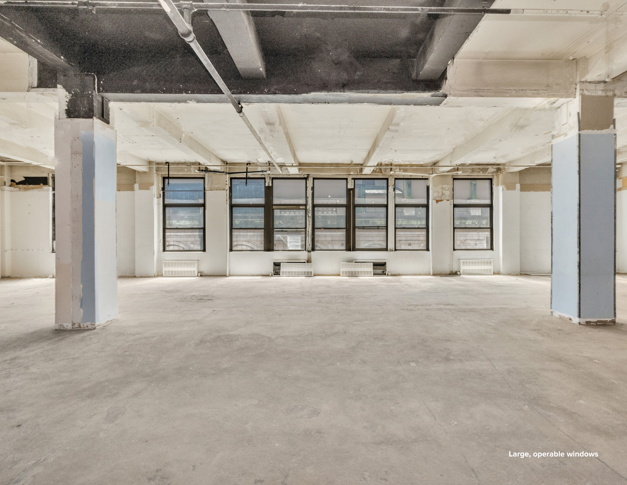
Large, operable windows