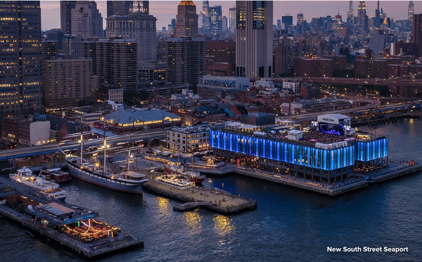
New South Street Seaport