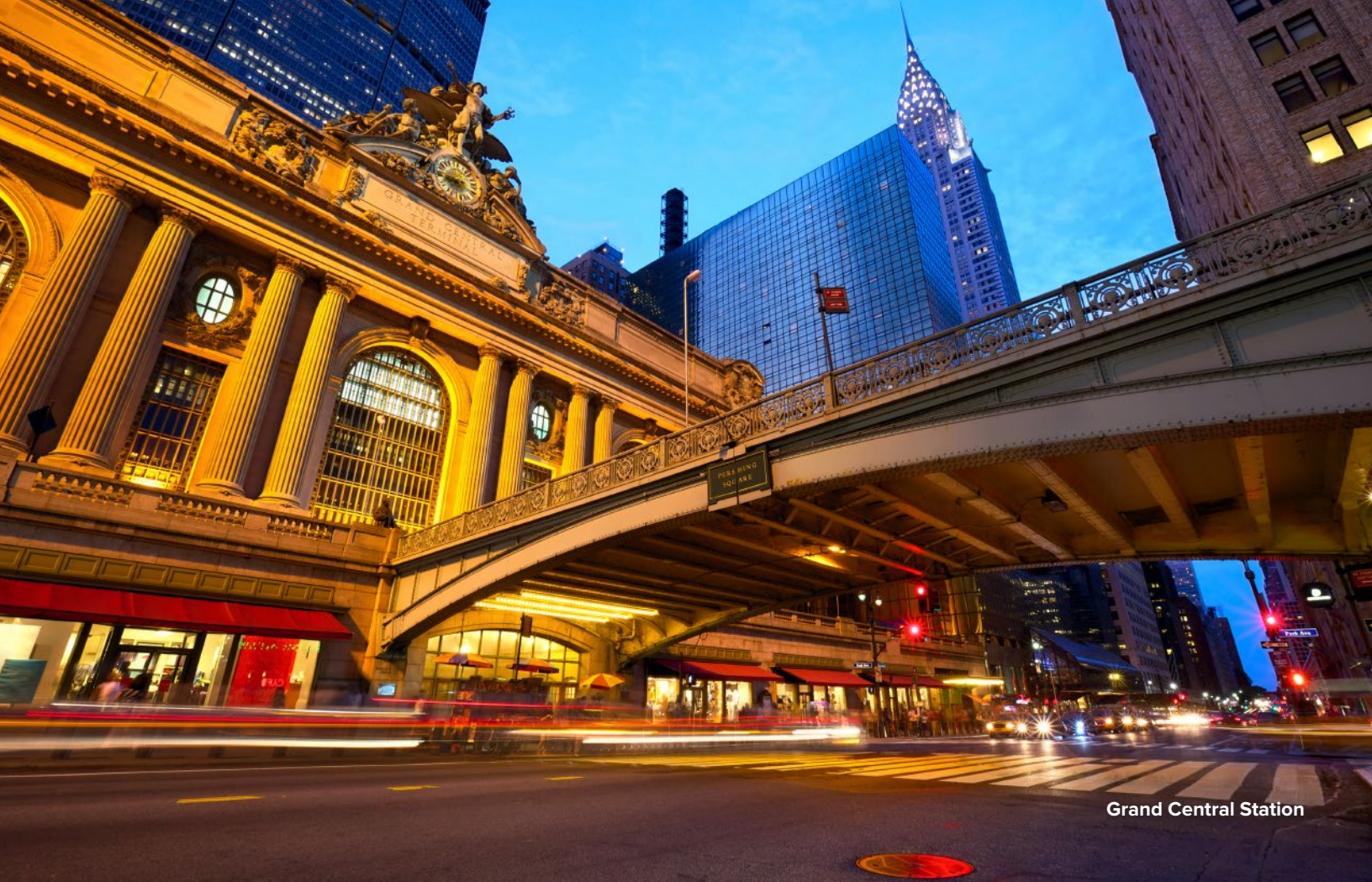
Grand Central Station