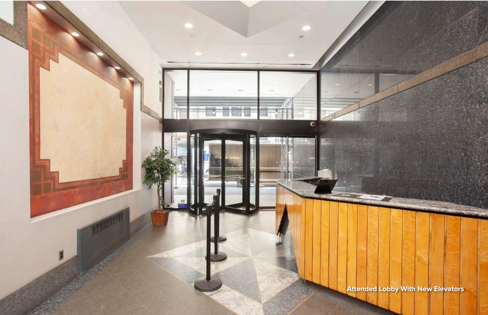
Attended Lobby With New Elevators