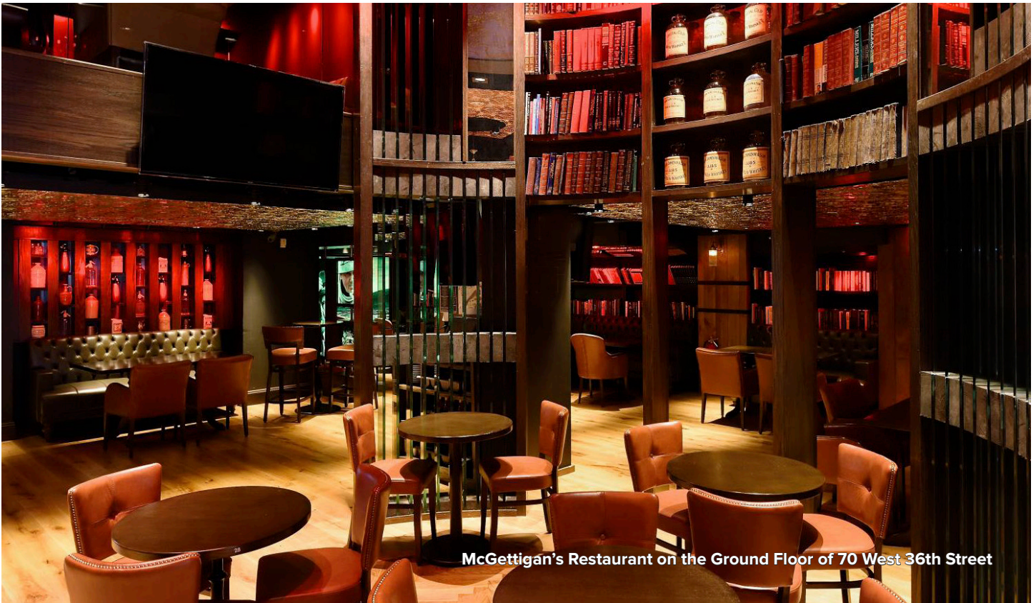
McGettigan's Restaurant on the Ground Floor of 70 West 36th Street