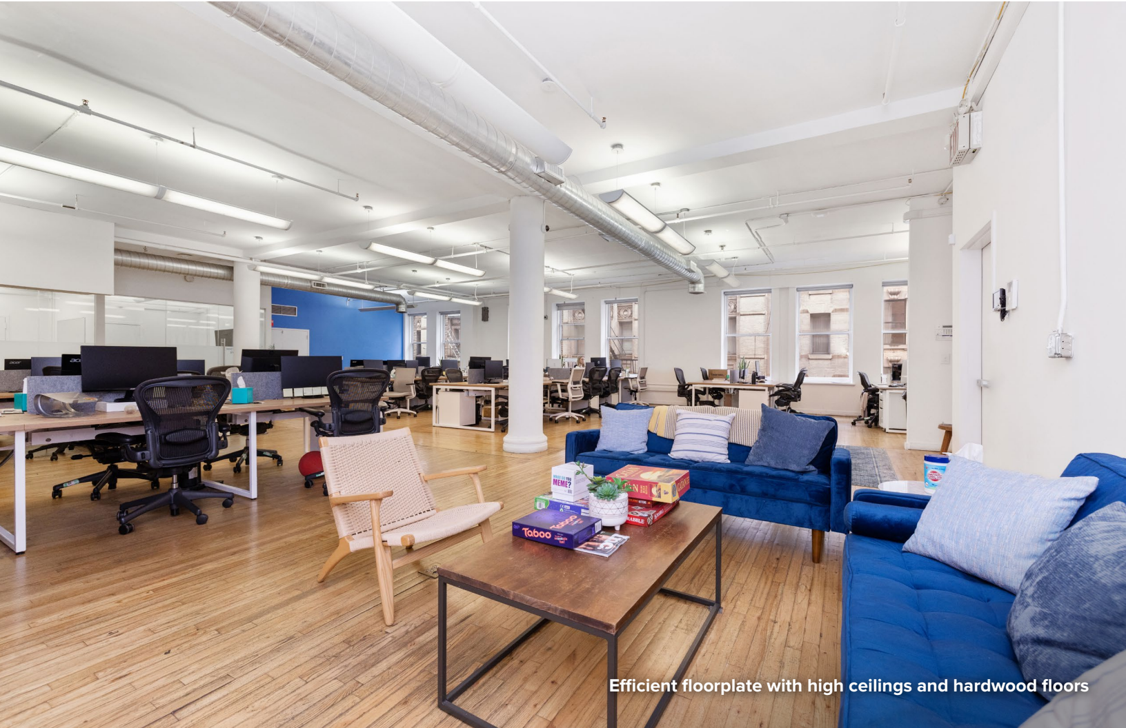
Efficient floorplate with high ceilings and hardwood floors