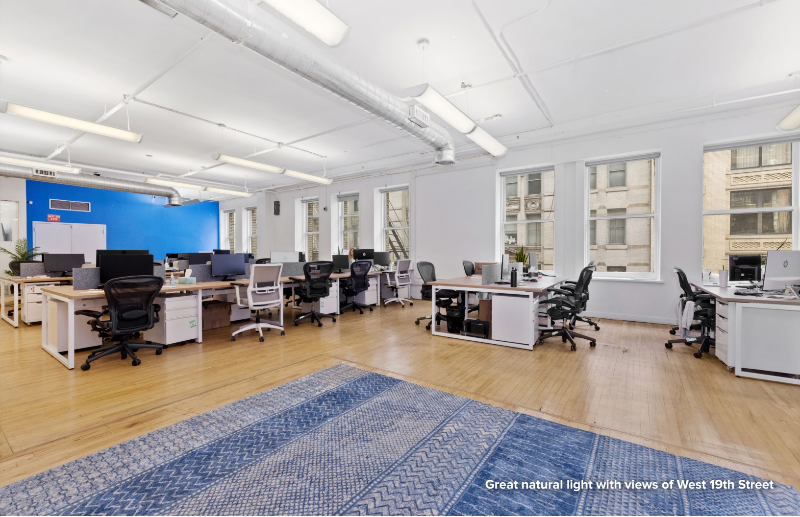
Great natural light with views of West 19th Street