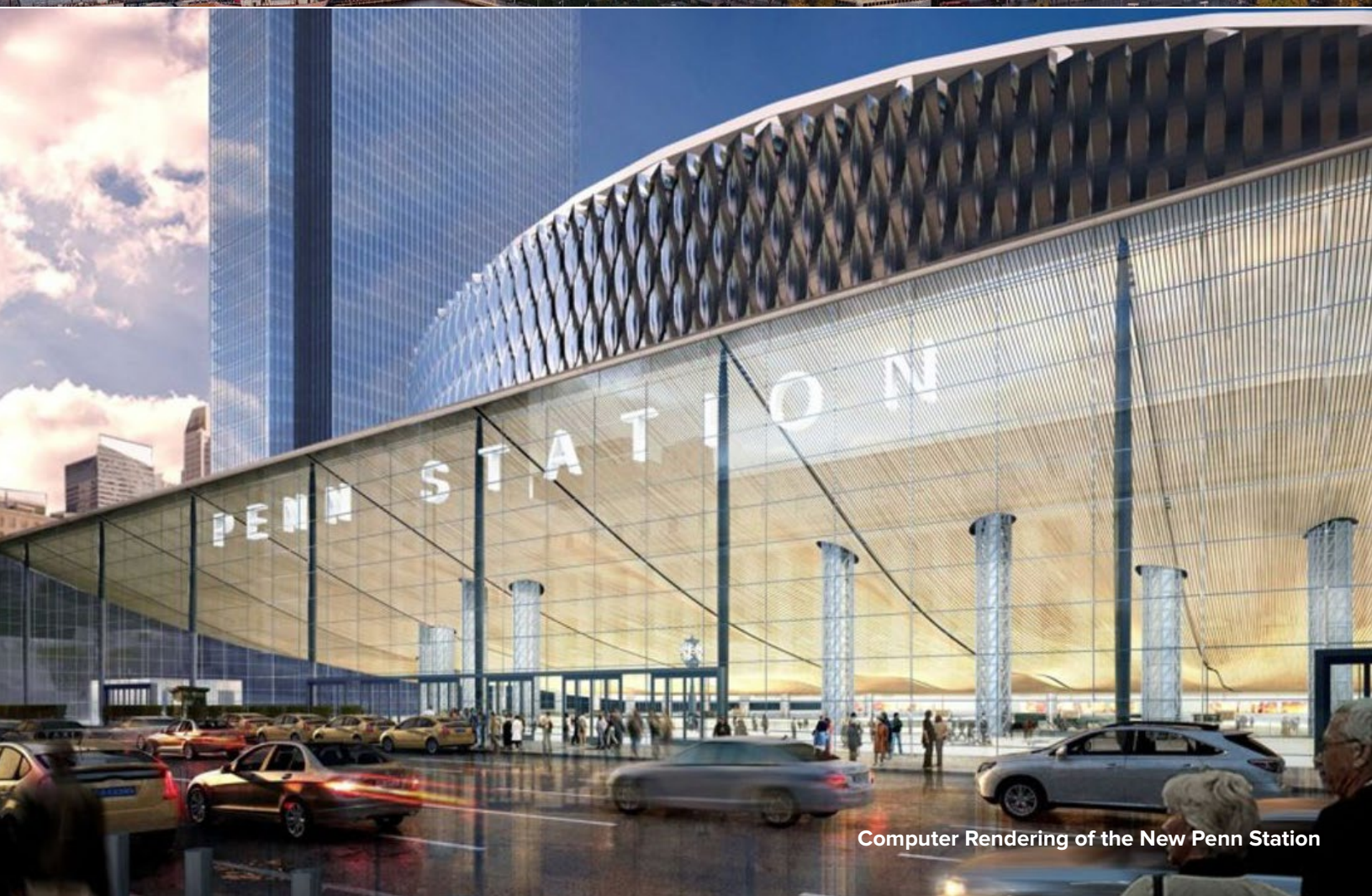
Computer Rendering of the New Penn Station