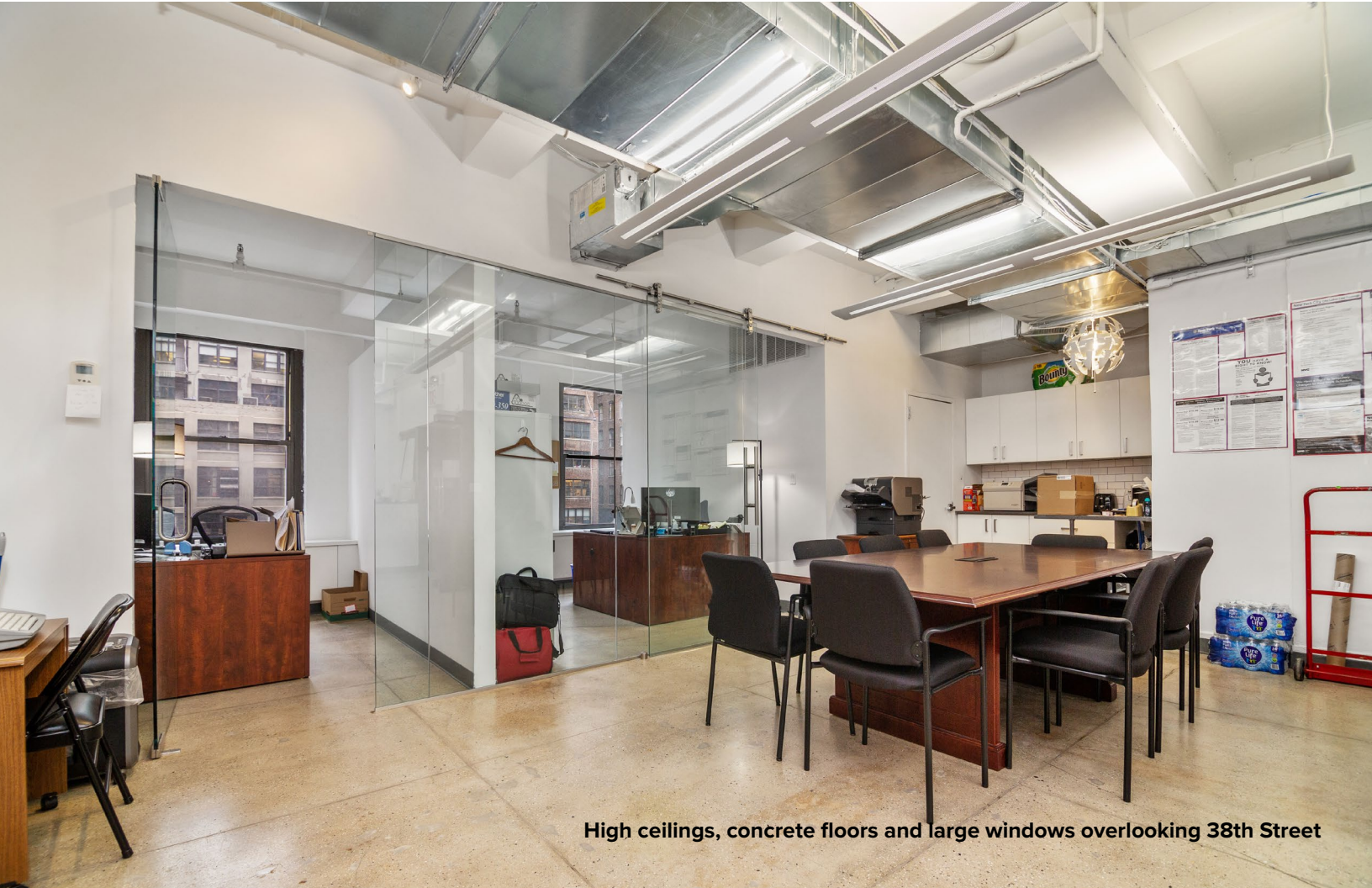
High ceilings, concrete floors and large windows overlooking 38th Street