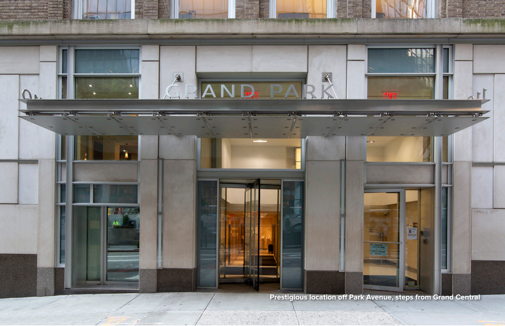
Prestigious location off Park Avenue, steps from Grand Central