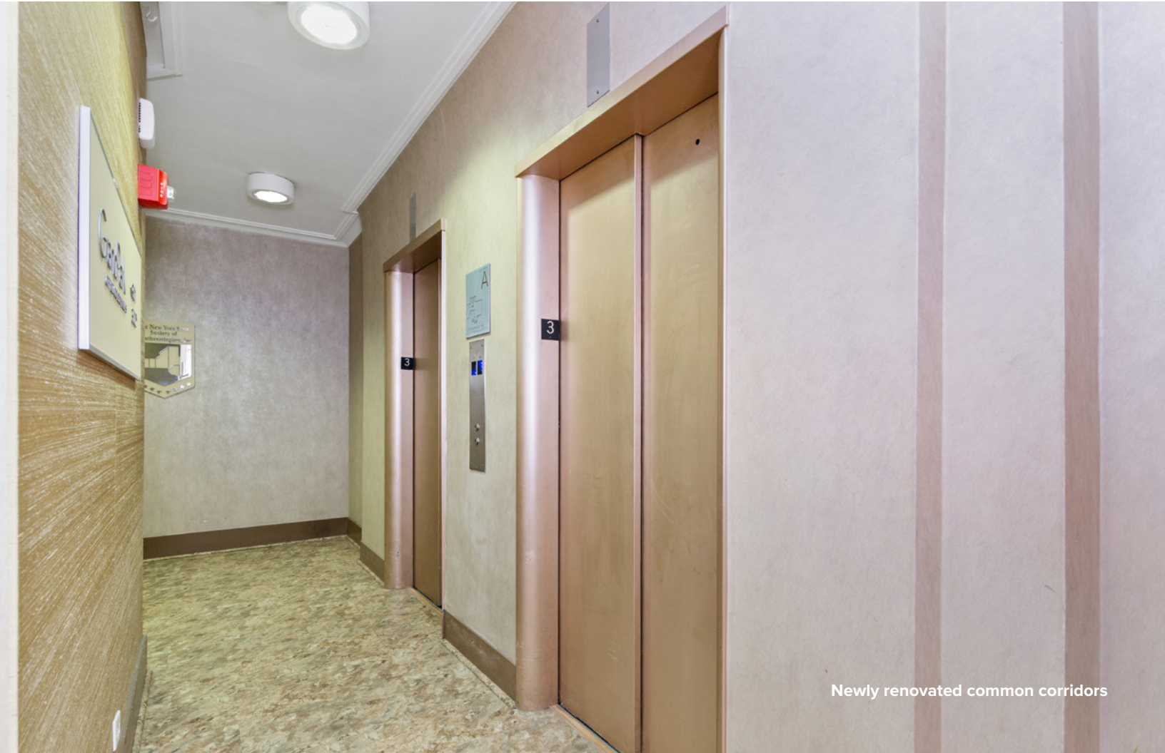
Newly renovated common corridors