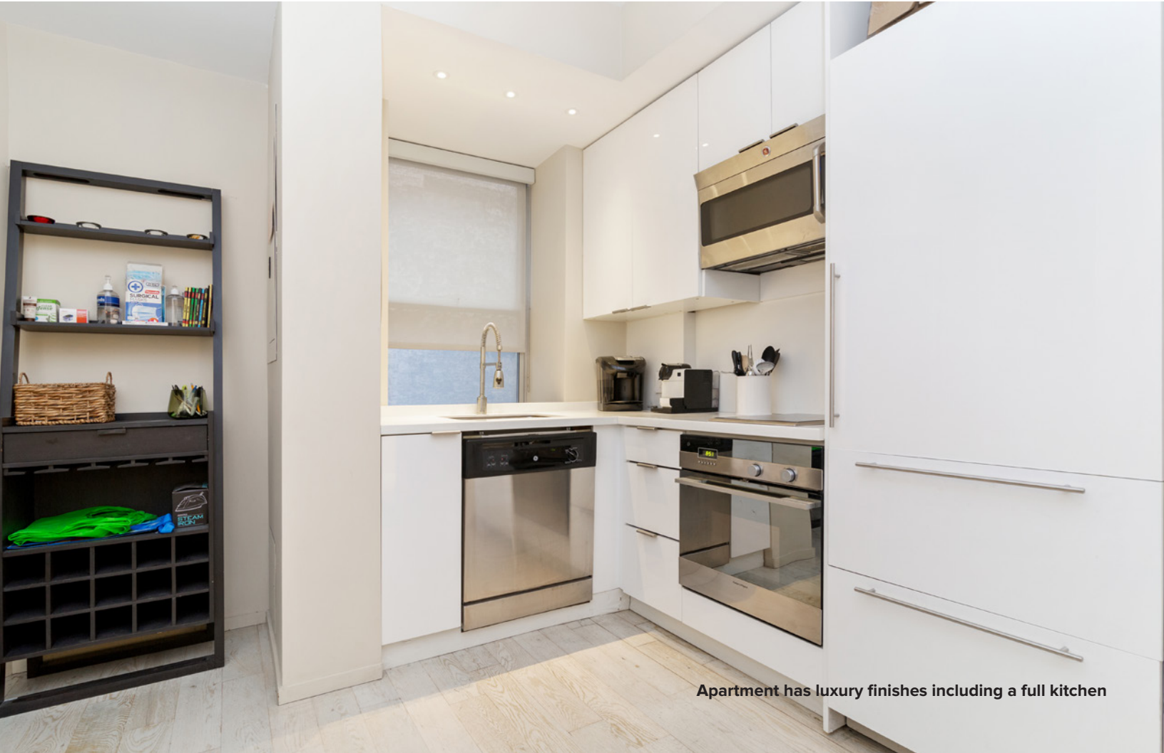
Apartment has luxury finishes including a full kitchen