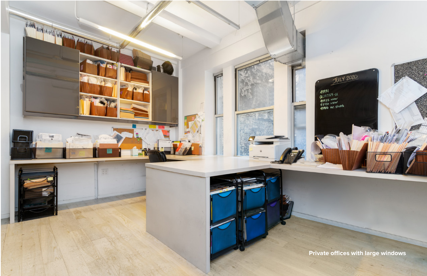
Private offices with large windows