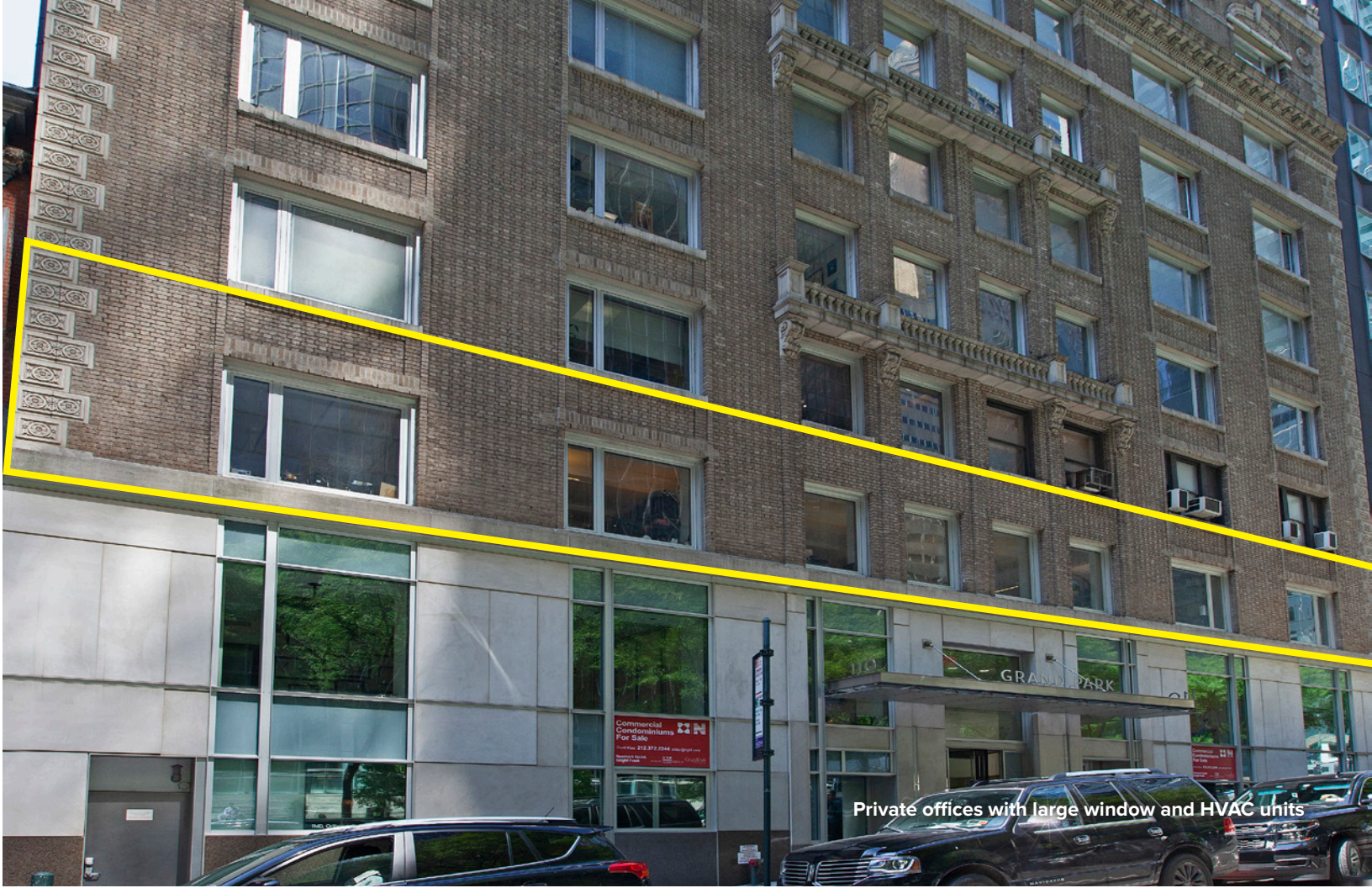
Private offices with large window and HVAC units